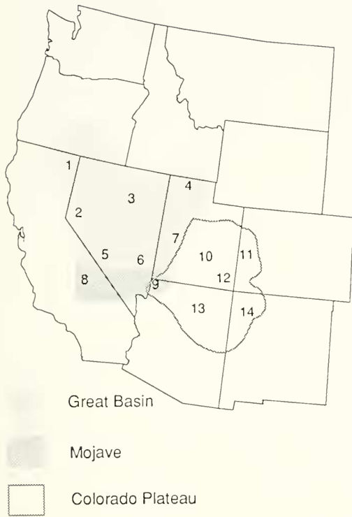
Fig. 1. Distribution of the major desert vegetation zones in the Great Basin and Colorado Plateau. Numbers indicate locations of climate stations for which data are presented in Table 1. Most of the Mojave Desert indicated is geologically part of the Great Basin, but, due to its lower elevation and warmer temperatures, it is climatically distinct from the rest of the region.

and drier Mojave Desert portion of the Great Basin will be considered primarily as a point of comparison, and for more thorough coverage of that region we recommend the reviews by Ehleringer (1985), MacMahon (1988), and Smith and Nowak (1990). For the higher montane and alpine zones of the desert mountain ranges, the reader is referred to reviews by Vasek and Thorne (1977) and Smith and Knapp (1990). We are indebted in our own coverage of the cold desert to other recent reviews, including Caldwell (1974, 1985), West (1985), Dobrowolski et al. (1990), and Smith and Nowak (1990).